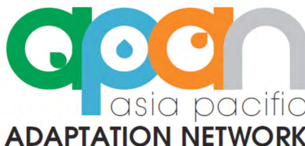
New APAN Logo

The Regional Climate Change Adaptation Knowledge Platform (AKP) was launched in 2008 as a partnership between United Nations Environment Programme (UNEP), Regional Resource Centre for Asia Pacific (RRC.AP), a centre at the Asian Institute of Technology collaborating with UNEP, and the Stockholm Environment Institute (SEI). It operated through a secretariat based in RRC.AP, and implemented activities in partnership with key centre of excellences and actors. The Adaptation Knowledge Platform was supported by the Swedish International Development Cooperation Agency (SIDA) through the Swedish Environmental Secretariat for Asia (SENSA).