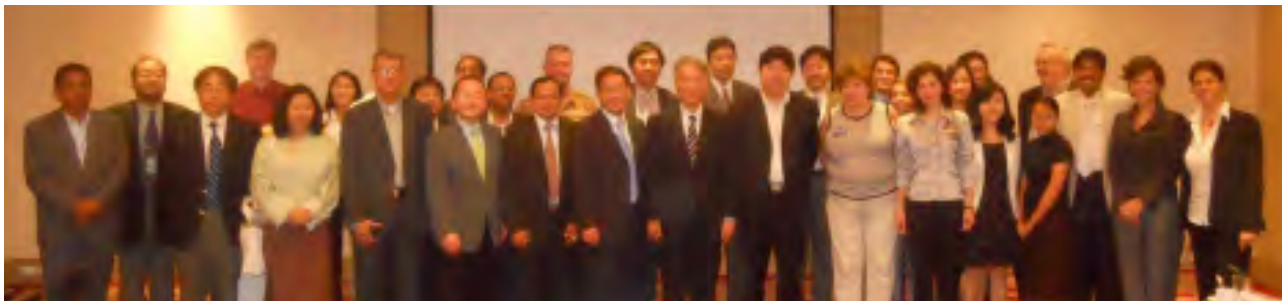
Asia Pacific Adaptation Network Steering Committee Meeting Members and Participants

The Regional Climate Change Adaptation Knowledge Platform for Asia (Adaptation Knowledge Platform) deliberated on synergies and collaborations at the first Asia Pacific Adaptation Network (Adaptation Network) Steering Committee Meeting, held on 8-9 March in Bangkok, Thailand.