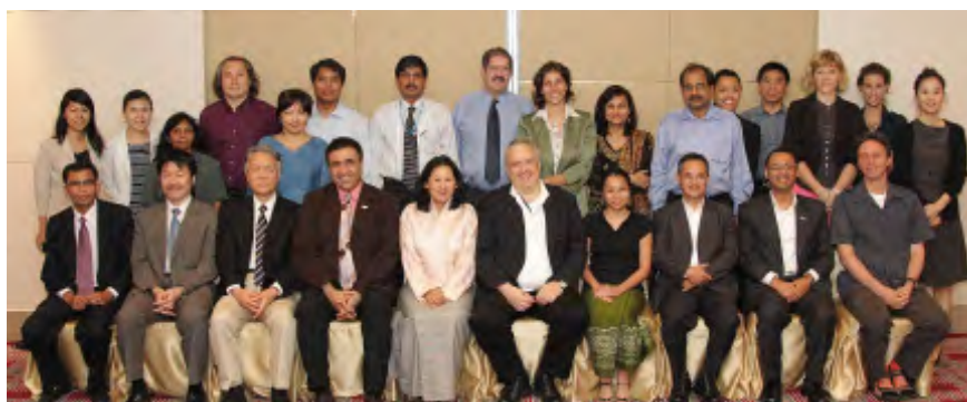
Advisory Panel Members and Participants